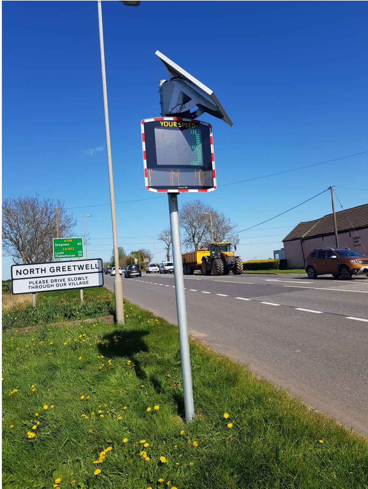
The recently purchased Speed Indicator sited on the A158 in North Greetwell